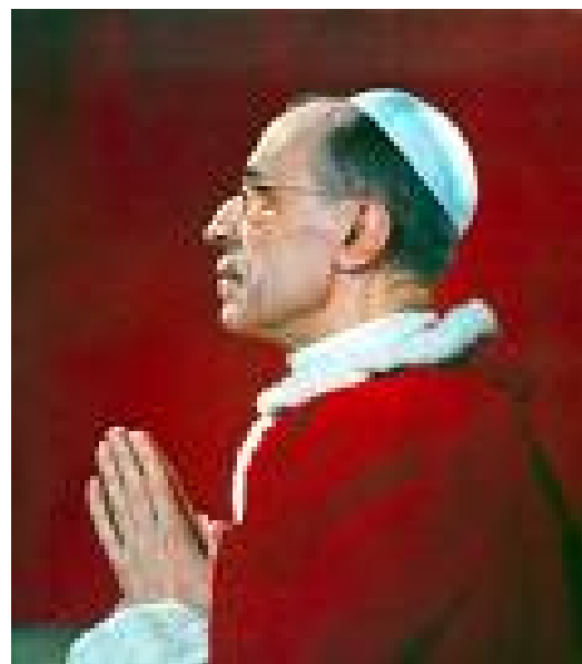
Eugenio Pacelli, Pope Pius XII

PTWF is blessed with a motivated board of directors and advisers who have seen the effectiveness of all of our past activities. Many of our past projects might have seemed too hot to touch but then resulted in very positive outcomes. Our directors and advisers have permitted us to move ahead in the furtherance of our mission without regard to popularity or its impact on fund-raising. We hope our work will shed a long-overdue light on history.