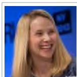
Facebook and Yahoo! Earnings Previews TheStreet