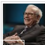
Warren Buffett's 10 Favorite Stocks Wall St. Cheat Sheet