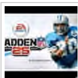
Is This the Last Super Bowl for Madden NFL? TheStreet