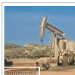
A billion-dollar daily shot in the arm for the American economy ExxonMobil Perspectives Blog